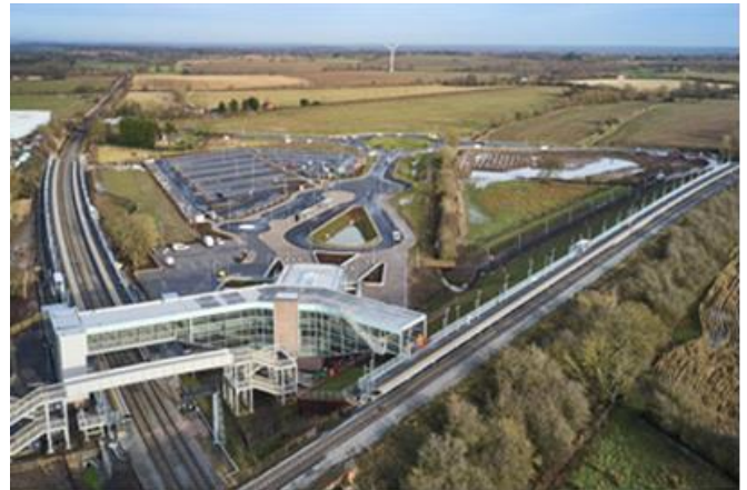
Figure 4: New Railway Station Worcestershire Parkway opened that links the Cotswold Line to the Cross Country Line so you can get on at Honeybourne and travel all the way to Cardiff or Nottingham, London to Worcestershire