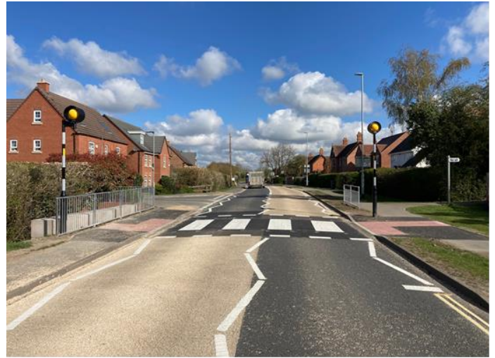
Figure 2 : Honeybourne Zebra Crossing on Station Road