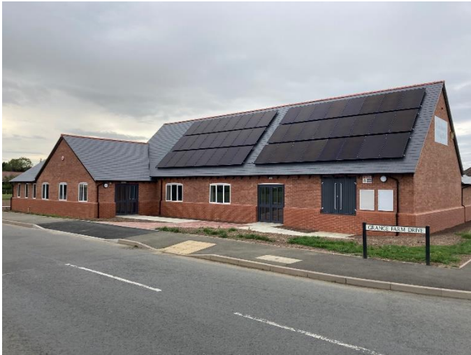
Figure 1 : Honeybourne Village Hall open by Sue Barker in September 2020