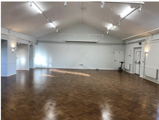
Figure 3 : Re-furbished village hall in Pebworth with an amazing refurbish wooden floor !